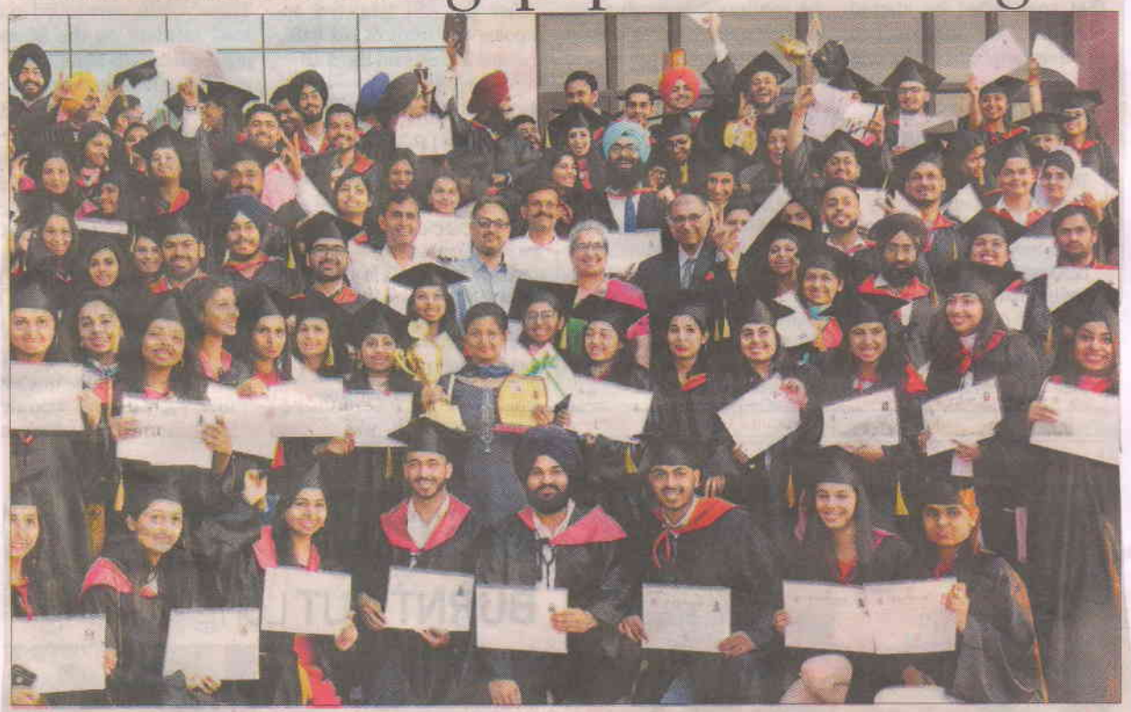
Students are all smiles after receiving degrees at the Government College of Commerce and Business Administration on Thursday.