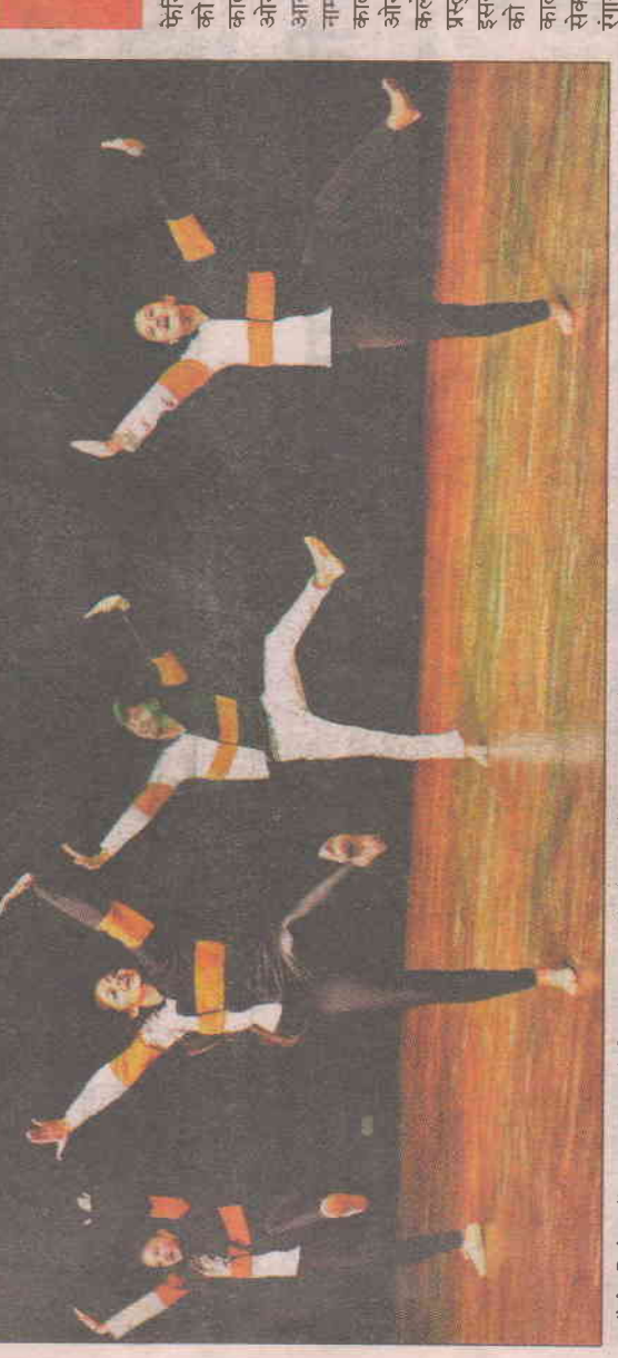
टैगोर थियेटर में यूथ कल्यरल फेस्टिवल २०१९ में गवनीर कालेज ऑफ कॉमर्स एंड बिजनेस एडमिनिस्ट्रेशन के स्टूडेंट्स भगड़ा डालते हुए।

कालेज की विद्यार्थियों की प्रस्तुति किया जाएगा। इसके अलावा 30 मार्च को गुरु गोबिंद सिंह फेस्टिवल में 29 मार्च को गवर्नमेंट होंम साइंस नामक इस फैशन शो में आयोजन होगा। आकृति कालेज फार वुमन सेक्टर-26 की ओर से कालेज सेक्टर-10 की ओर से खूबसूरत कलेक्शन को रैंप पर ओर से फैशन शो का रंगारंग कार्यक्रम की