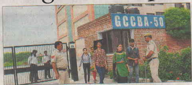
With no student poll, the Government College of Commerce, Sector 50, campus wears a deserted look. MANOJ MAHAJAN

In MCM DAV College, Sector 36, it is apparently a direct appointment for the posts of the president and the vice-president as the candidature of all girls was not considered. While for the post of the joint secretary, no candidate was found eligible by the college committee. Only for the post of the secretary, five girls will contest. Even at the Government College for Girls, Sector 11, only two candidates each for four posts have been