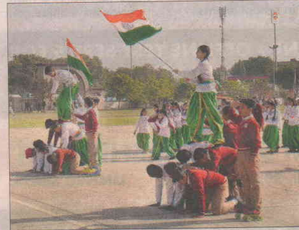
Full dress rehearsals under way at Chandigarh and Panchkuja On Thursday