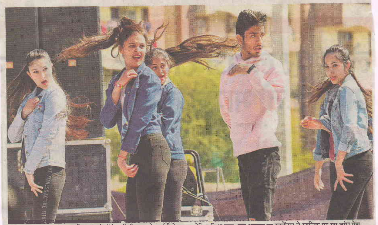
रांडीगढ़ | सेक्टर-50 के गवर्नमेंट कॉमर्स कॉलेज में वीरवार को आईटी फेस्ट आयोजित किया गया। इस अवसर पर स्टूडेंट्स ने म्यूजिक पर ग्रुप डांस पेश किया। इसके बाद स्टूडेंट्स ने कई तरह की एक्टीविटीज में पार्टिसिपेट कर अपनी परफॉमेंस पेश की। कॉलेज प्रिंसिपल और स्टाफ ने स्टूडेंट्स की सराहना की।