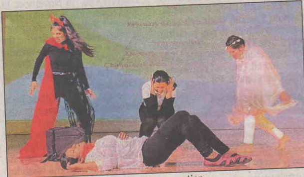
Students perform a skit on water conservation